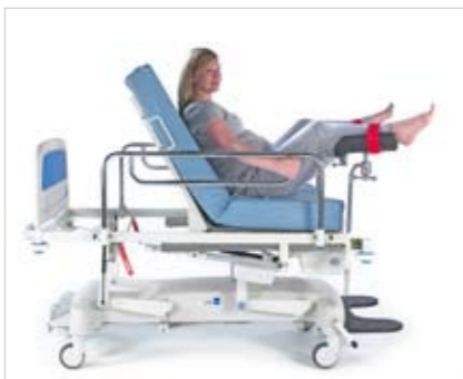
Lithotomy position with leg rests