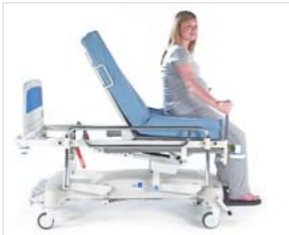
Chair position with handgrips and step