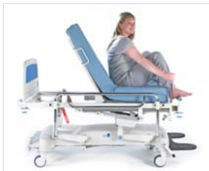
Chair with high foot supports and handgrips