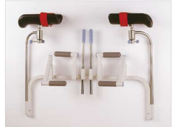
Convenient storage: wall-mounted accessory rack