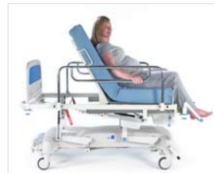
Chair position with low foot supports and safety sides raised