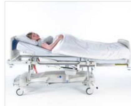
Standard bed position

ArjoHuntleigh is a branch of Arjo Ltd Med. AB. Only ArjoHuntleigh designed parts, which are designed specifically for the purpose, should be used on the equipment and products supplied by ArjoHuntleigh. As our policy is one of continuous development we reserve the right to modify designs and specifications without prior notice. ® and ™ are trademarks belonging to the ArjoHuntleigh group of companies. © ArjoHuntleigh, 2009