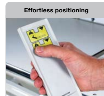
Electrically operated height and backrest adjustments reduce handling risks.