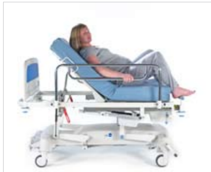
Semi-chair position with high foot supports and safety sides raised