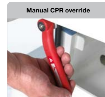
Dual-sided levers lower the backrest instantly in the event of an emergency.